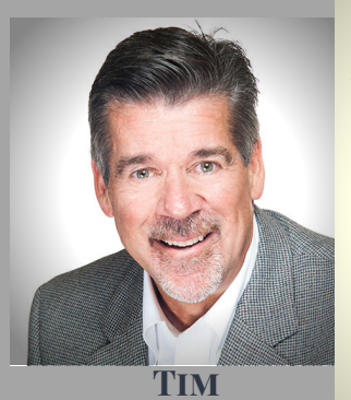
KIGHT Morning Keynote